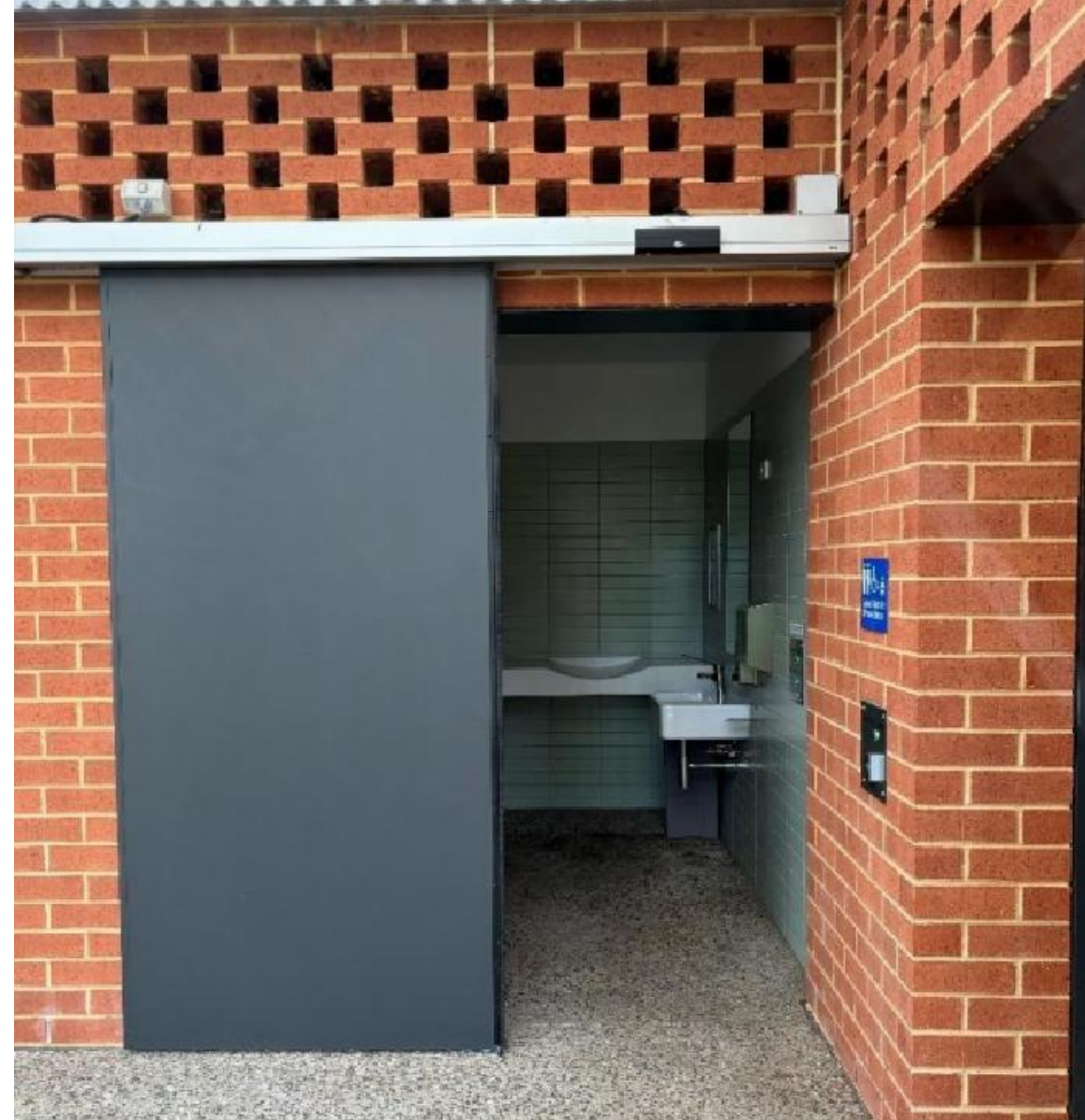
Alt Text: Partially open metal door revealing a clean public restroom inside a brick building. Visible sink, mirror, and the wall has a "baby change" sign.

All bathrooms include a baby change table.