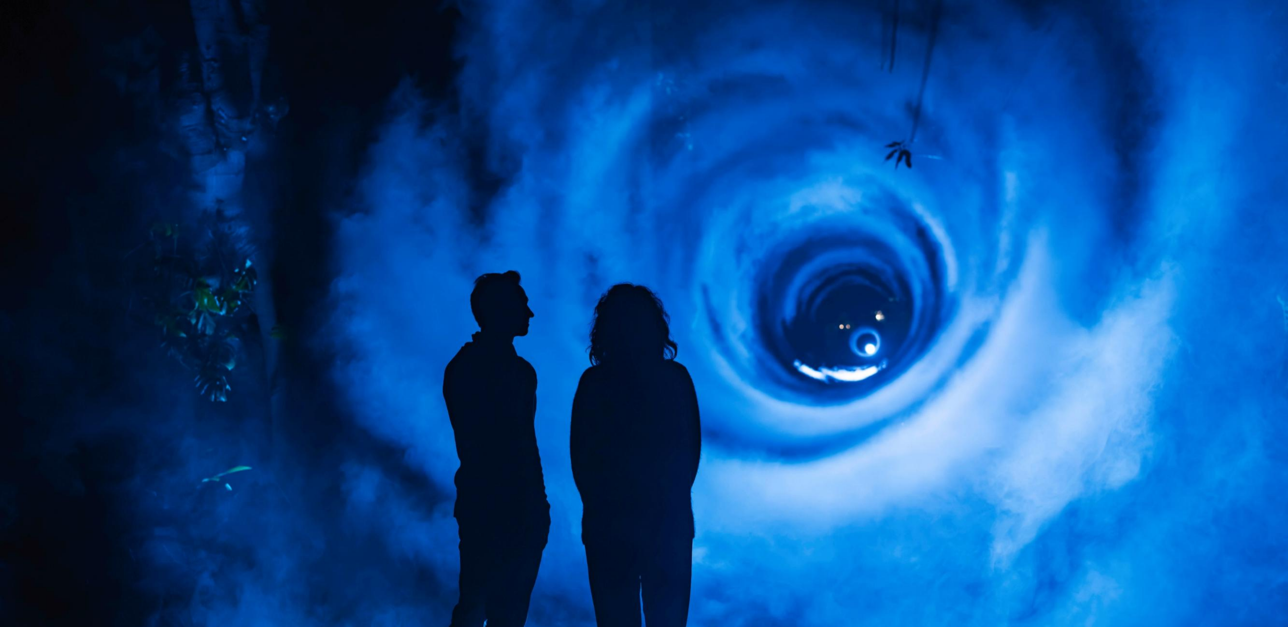
Alt Text: Two figures stand facing a striking blue vortex, their postures suggesting fascination with the mesmerizing phenomenon.