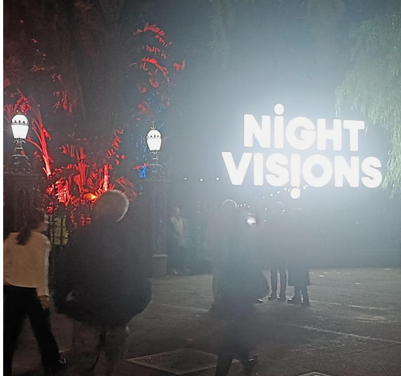
Alt Text: Groups of people gather at night in front of a bright "Night Visions" sign at the entry to Adelaide Botanic Garden Main Gate. Red-lit trees create an eventful atmosphere.

Your tickets will be scanned by staff further down the pathway as you enter the gate. You may need to queue before having your ticket scanned. Queuing will occur inside the Main Gate of Adelaide Botanic Garden.