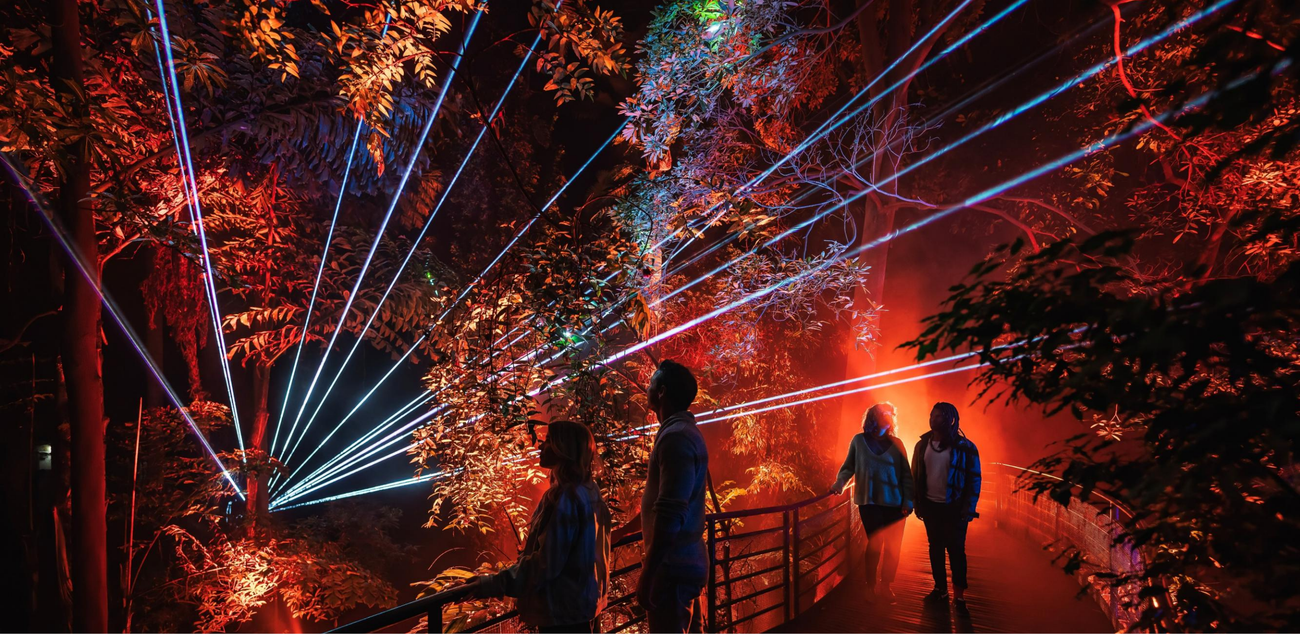
Alt Text: People walking through a vibrant forest illuminated by colourful laser lights.