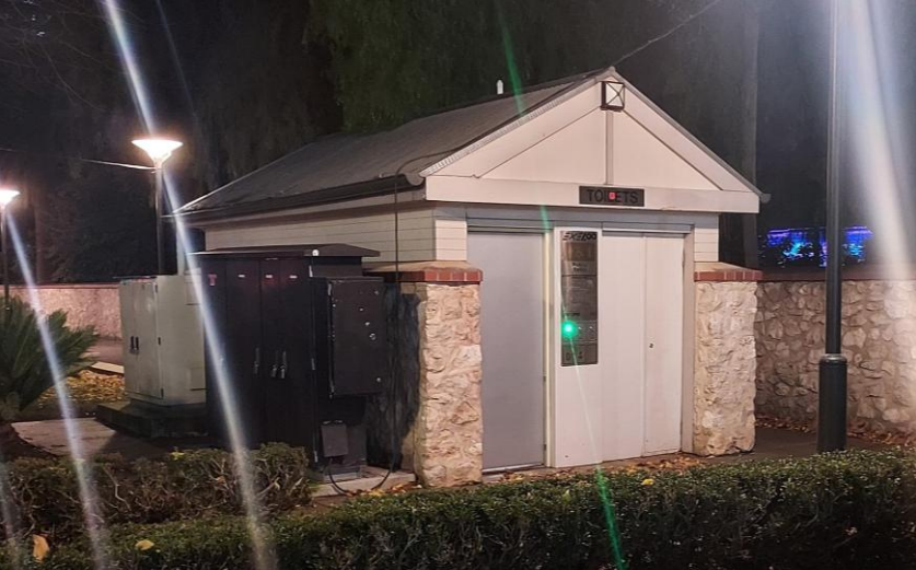
Alt Text: The access toilets on Kintore Avenue are in a small white building pictured here at night, surrounded by a stone wall and hedges. Dim streetlights illuminate the scene.