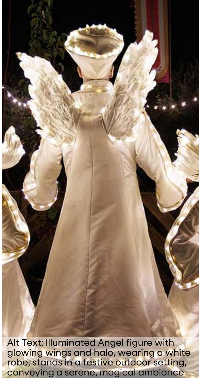
Alt Text: Illuminated Angel figure with glowing wings and halo, wearing a white robe, stands in a festive outdoor setting, conveying a serene, magical ambiance.