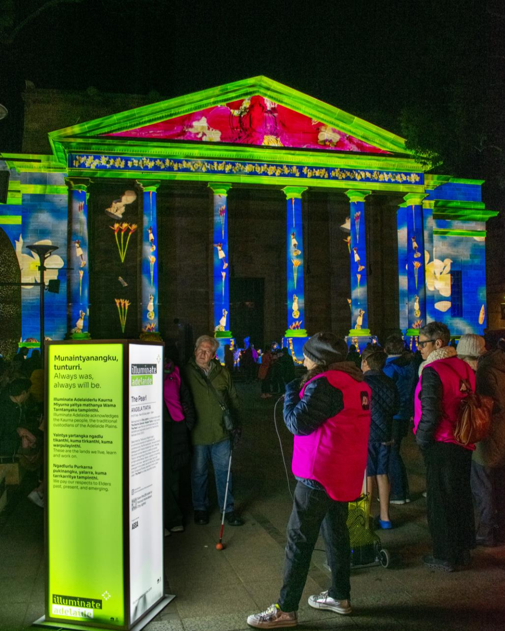
Alt Text: An Audio Describer in a pink vest leads a tour group in front of projection art on the Art Gallery of South Australia.