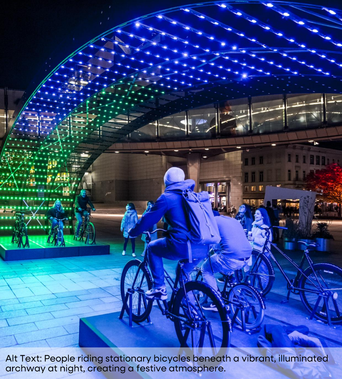
Alt Text: People riding stationary bicycles beneath a vibrant, illuminated archway at night, creating a festive atmosphere.