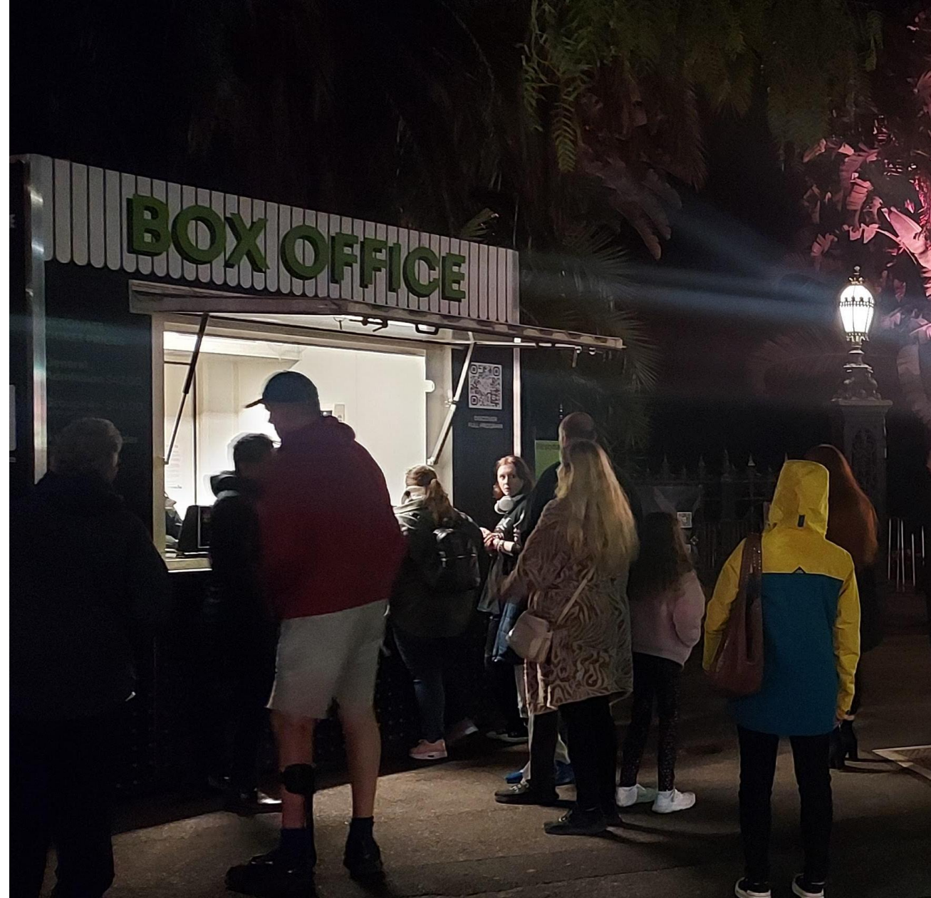
Alt Text: People line up outside the Box Office.

There will be staff here during the opening hours of Night Visions .