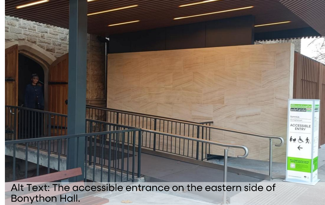
Alt Text: The accessible entrance on the eastern side of Bonython Hall.

Beside this entrance are accessible toilets.