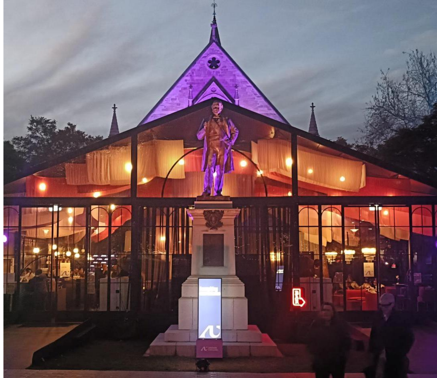
Alt Text: Lumen is a glass-fronted building with warm, colourful lights and a statue of Sir Thomas Elder in front. Evening setting, with vibrant purple and green lighting creating a festive atmosphere.

This area can be very crowded and loud with DJs starting from 4:30pm each night.