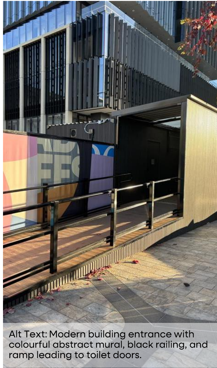
Alt Text: Modern building entrance with colourful abstract mural, black railing, and ramp leading to toilet doors.