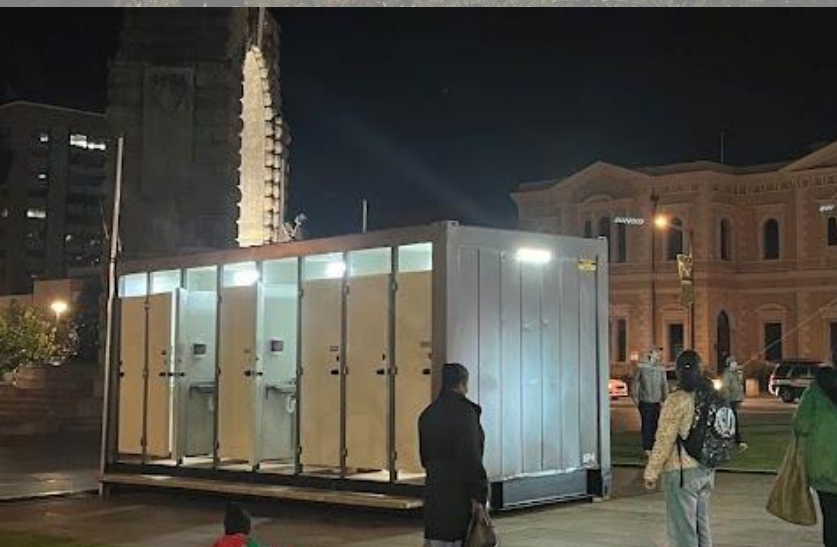
Alt Text: Outdoor portable toilets at night, next to the National War Memorial. Lit buildings in the background create an urban evening atmosphere.