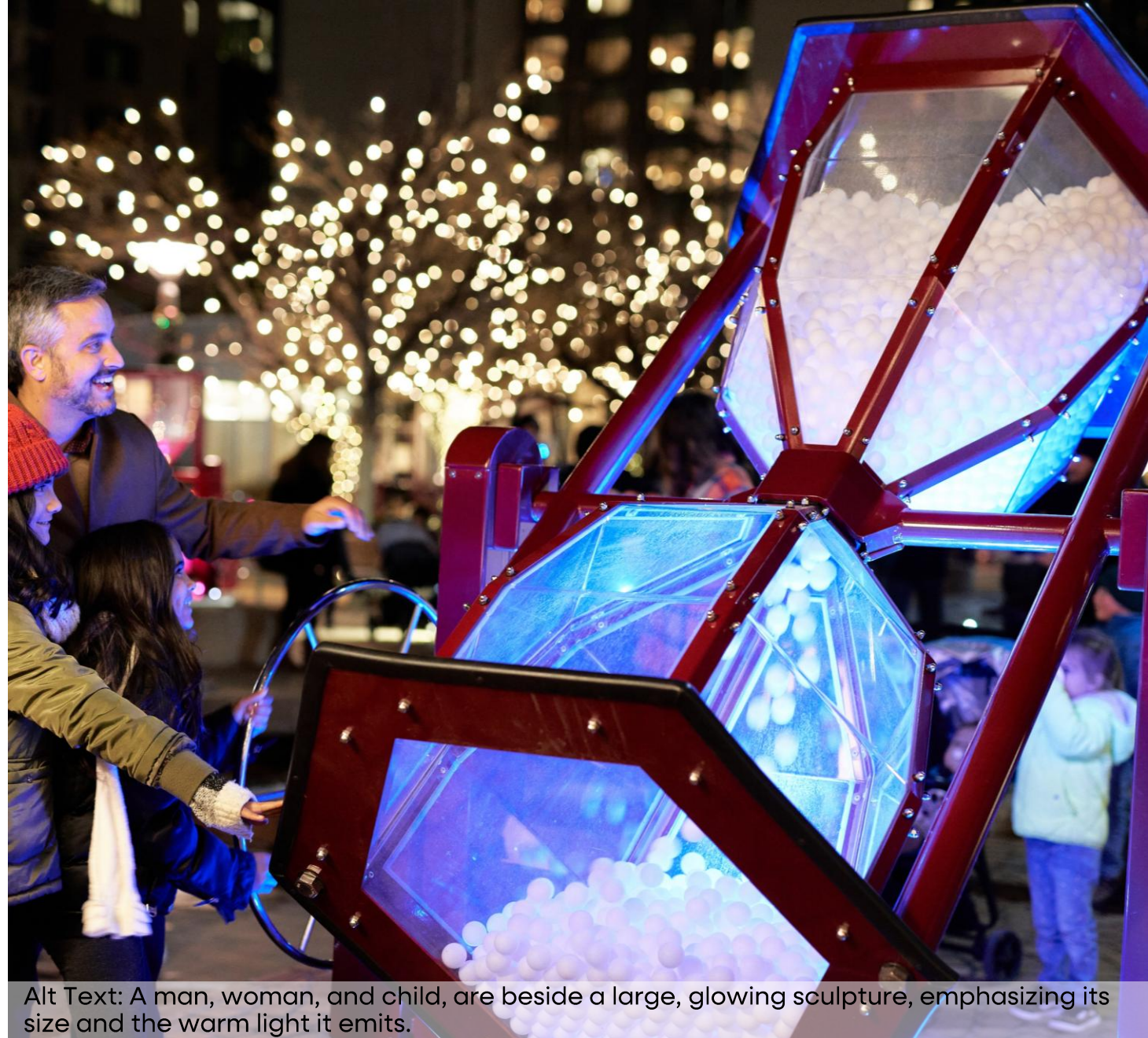
Alt Text: A man, woman, and child, are beside a large, glowing sculpture, emphasizing its size and the warm light it emits.

Paxtons Walk can be a quick way to get from Base Camp to Rundle Street. It is illuminated by festoon lighting.