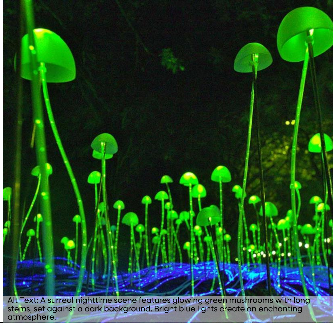
Alt Text: A surreal nighttime scene features glowing green mushrooms with long stems, set against a dark background. Bright blue lights create an enchanting atmosphere.

There is no sound accompanying this installation.