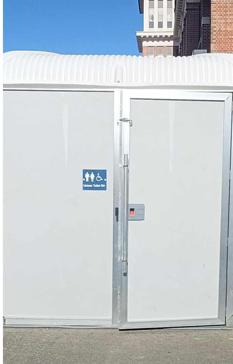
Alt Text: A portable modular toilet unit with a white exterior.

In the accessible toilet, the tap and toilet flush is operated by hand pump.