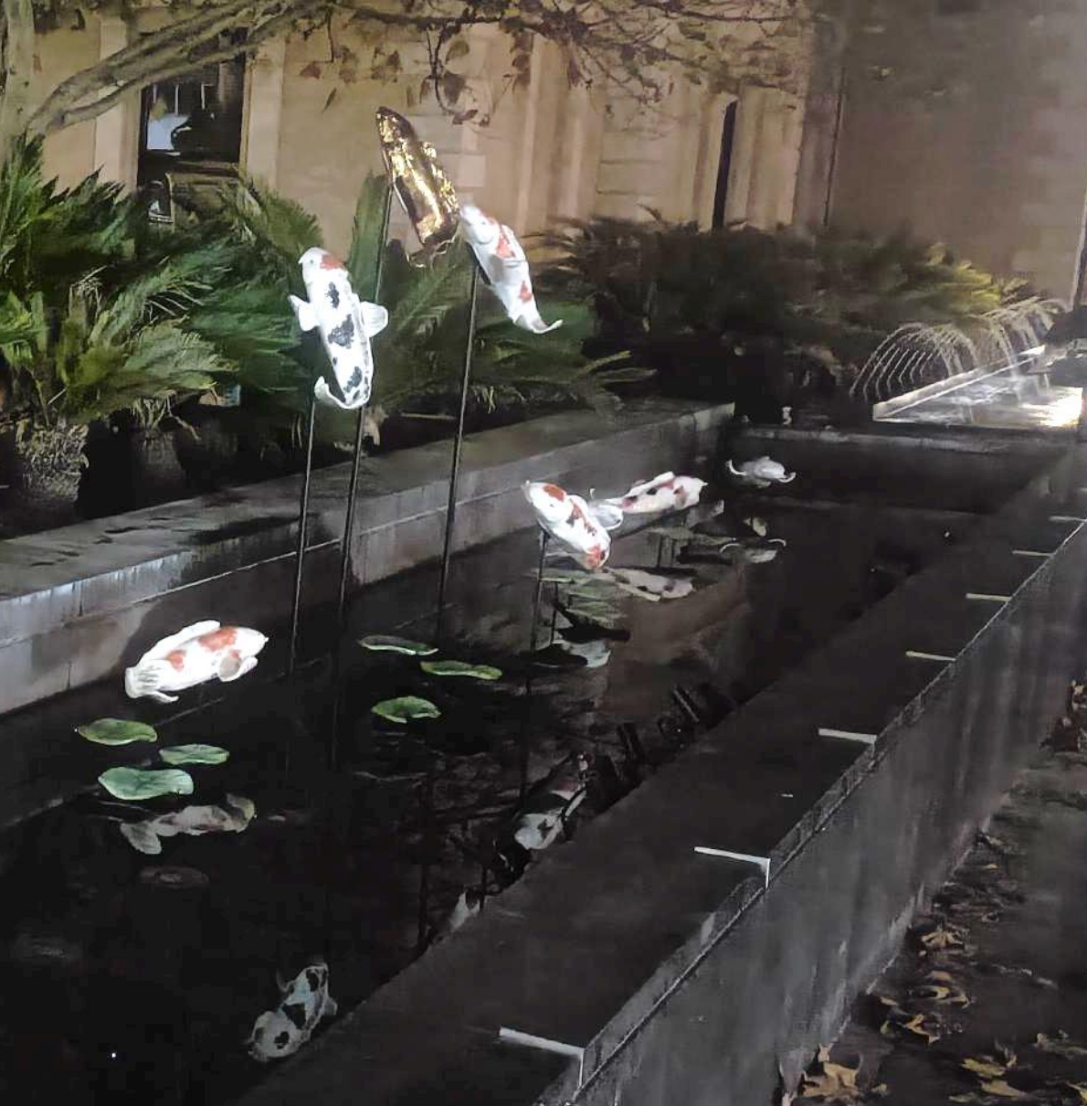
Alt Text: Illuminated koi fish sculptures and lily pads appear to float above a dark, rectangular water feature. Ambient lighting creates a tranquil atmosphere.