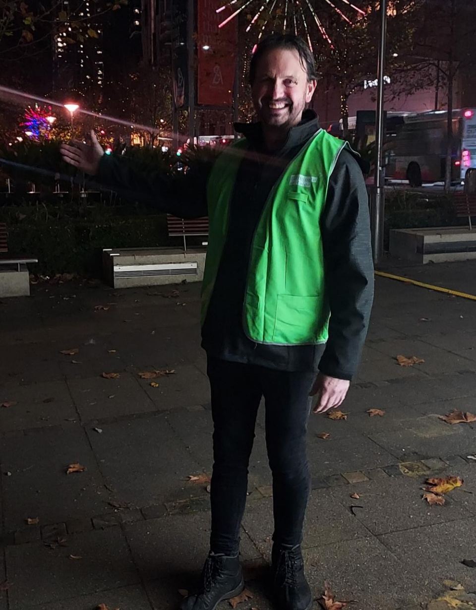
Alt Text: An Illuminate Adelaide staff member in a green vest.