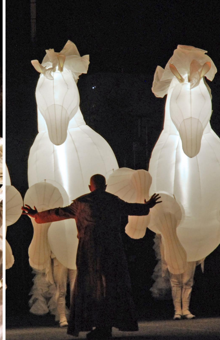
Alt Text: A person stands with outstretched arms facing giant luminous horse figures in a dark setting, creating a surreal and whimsical atmosphere.