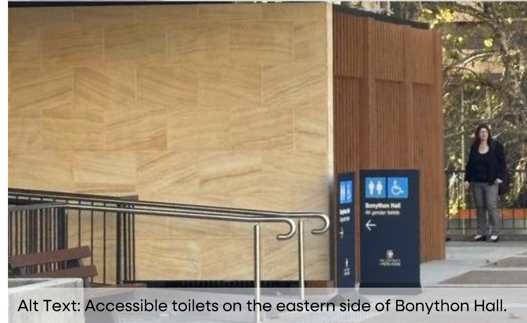
Alt Text: Accessible toilets on the eastern side of Bonython Hall.