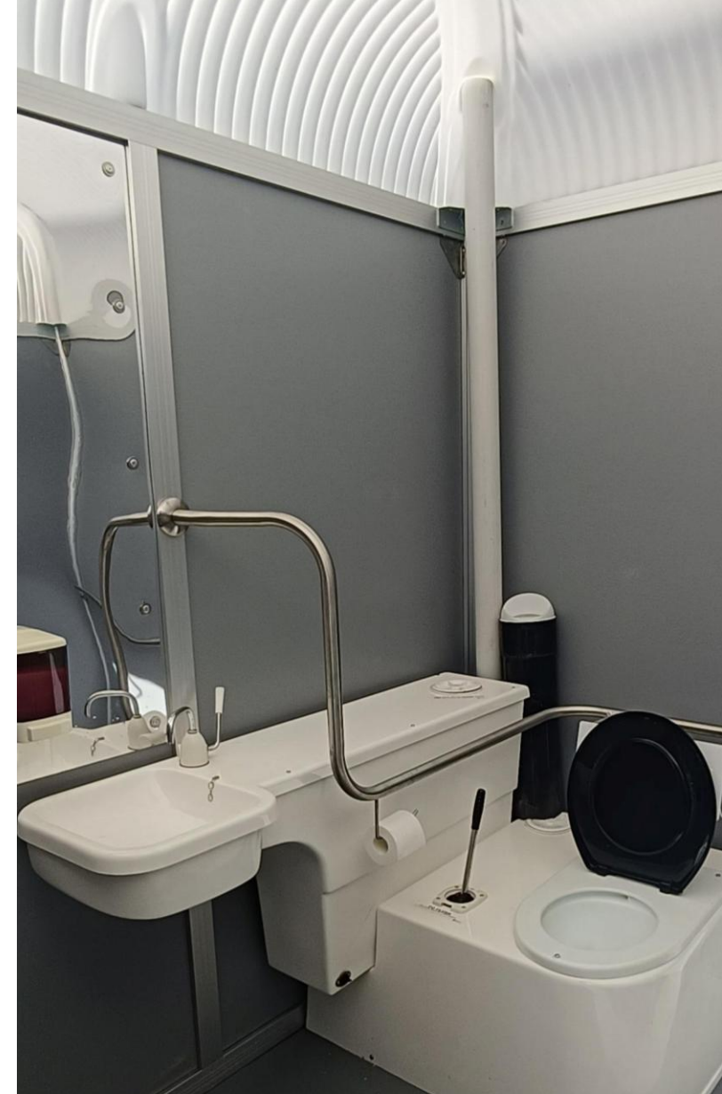
Alt Text: Interior of a portable restroom with a toilet, small sink, soap dispenser, and handrails.