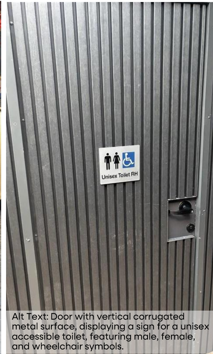
Alt Text: Door with vertical corrugated metal surface, displaying a sign for a unisex accessible toilet, featuring male, female, and wheelchair symbols.