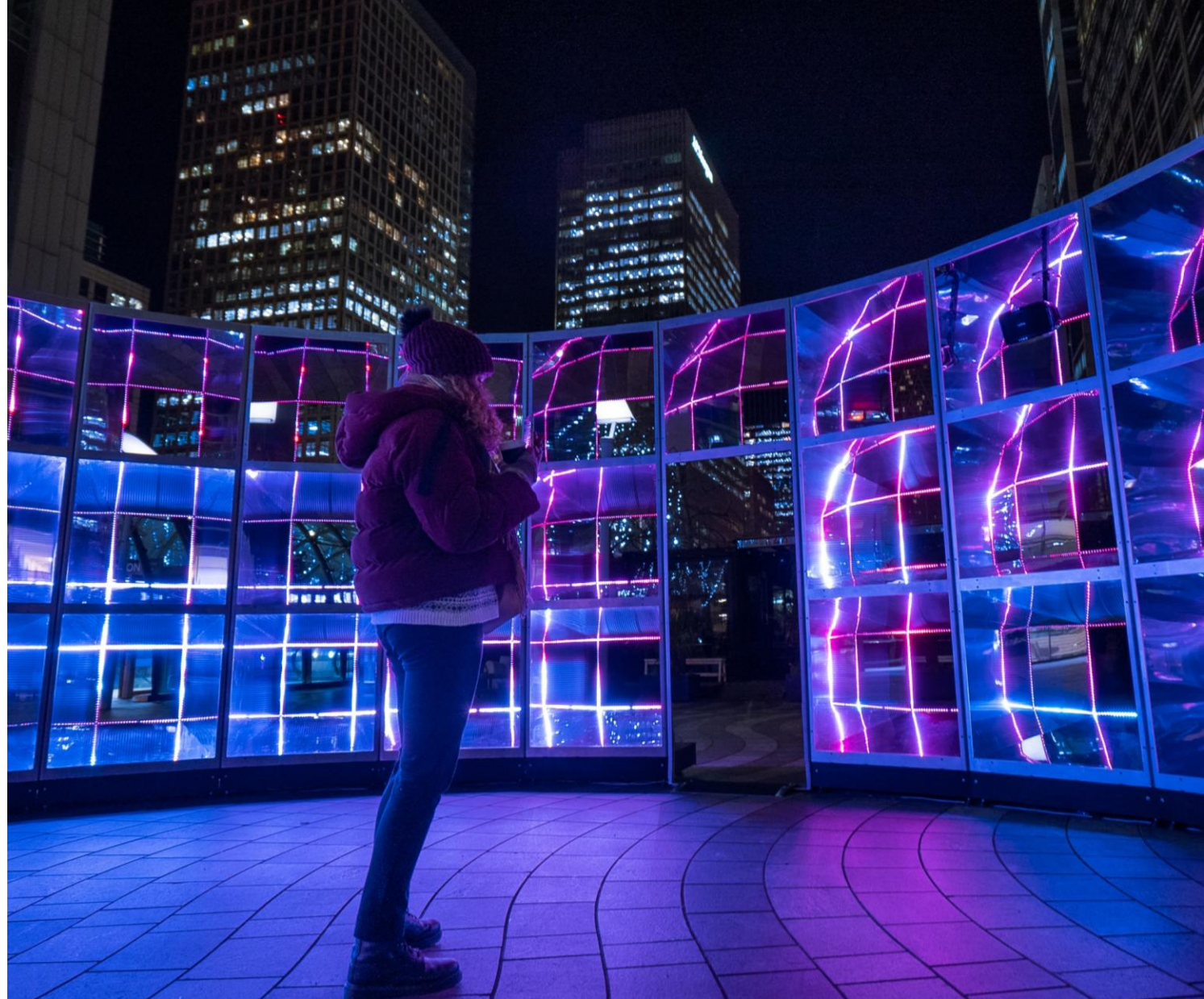
Alt Text: A woman poses in front of a building adorned with striking purple lights, creating a colourful nighttime scene.

You can also access the Audio Description by clicking here .