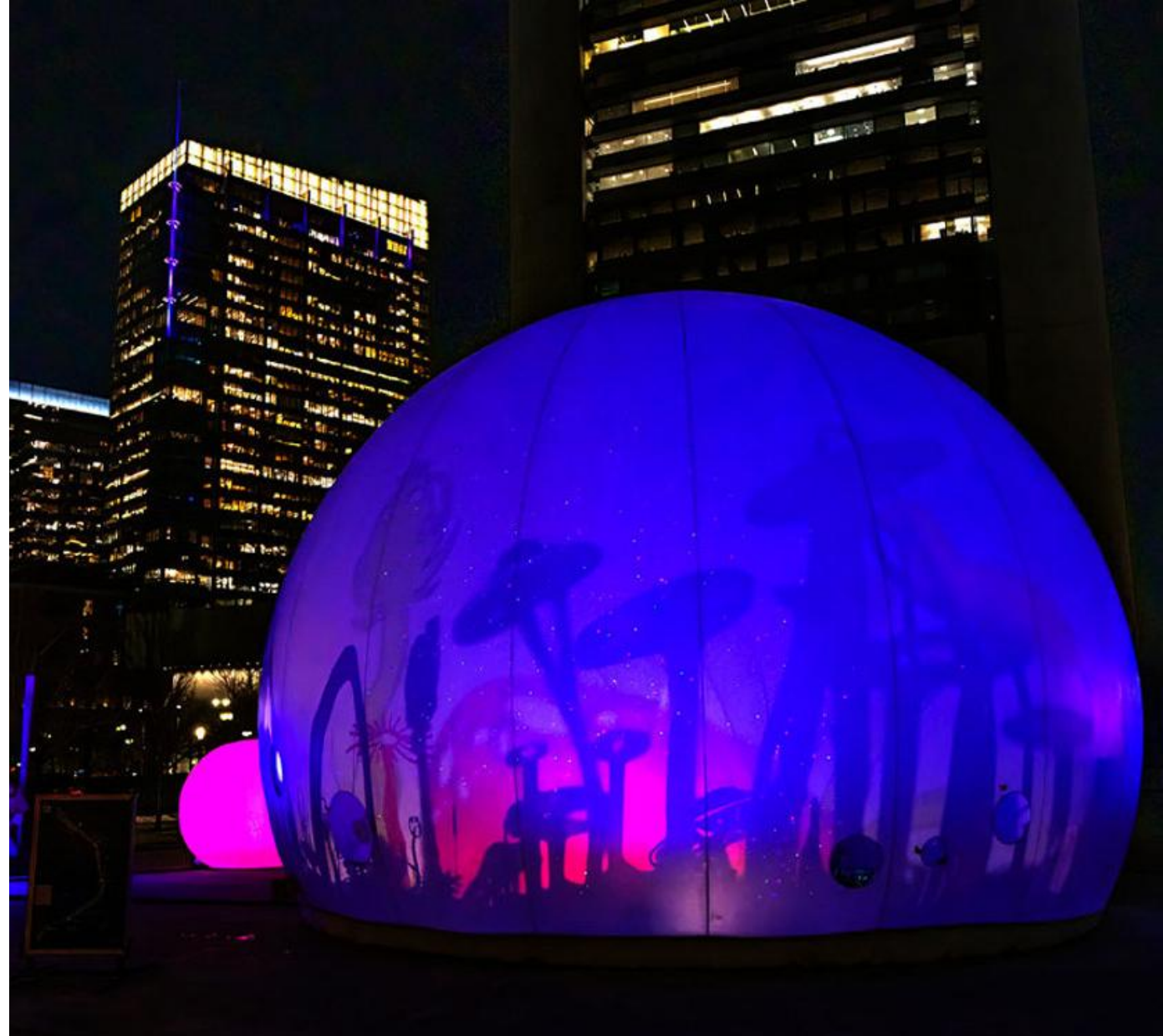
Alt Text: A large illuminated dome glows with blue and pink colours, casting shadows of tall mushrooms inside. High-rise buildings twinkle in the night background.

The path next to the installations, on the eastern side, is accessible via a ramp. Two of the globes are on bark chip floor, with the rest on lawned gardens.